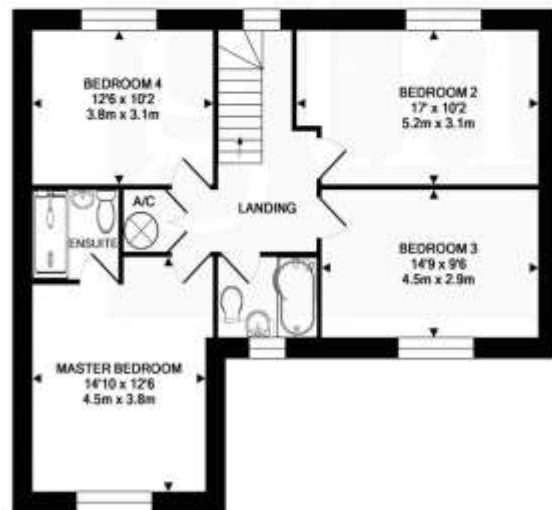
1ST FLOOR APPROX. FLOOR AREA 809 SQ.FT. (75.2 SQ.M.)

WHITFIELD LANE NEW BUILDS SOUTH PETHERTON TOTAL APPROX. FLOOR AREA 1627 SQ.FT. (151.1 SQ.M.) Measurements are approximate. Not to scale. Illustrative purposes only. Made with Metropix 02/16